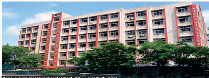
Kapod Vidyandhi International School (ICSE), Kandivali (West)